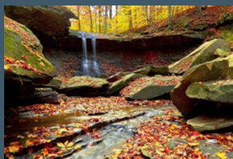
Autumn in the Park