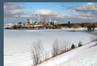
Lake Erie in Winter

For more information about Cleveland, visit these resources: