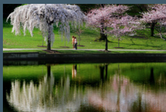
Art Museum Duck Pond in Spring