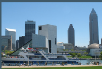
Cleveland skyline in Summer