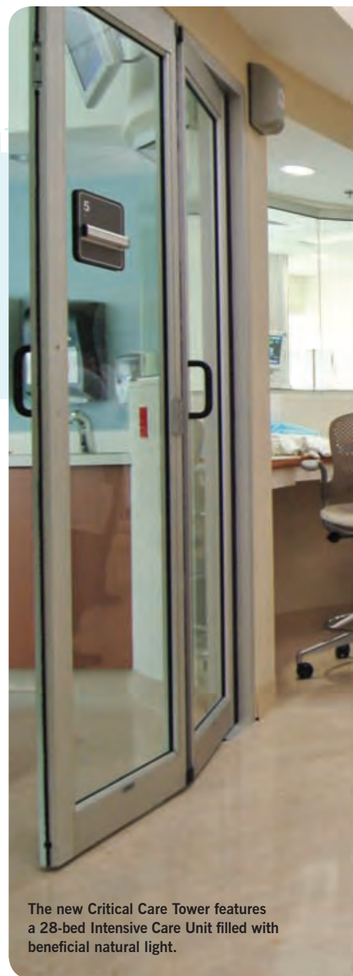
The new Critical Care Tower features a 28-bed Intensive Care Unit filled with beneficial natural light.

The new Critical Care Tower at Marymount also features a 30-bay Emergency Department accessible through two new entrances at the west end of the hospital building, one solely for ambulances and the other for walk-in patients. The two access points and a new circular drive are designed to ease congestion in the busy department, which treated nearly 36,000 patients in 2006. The new ED features a spacious, well-lit