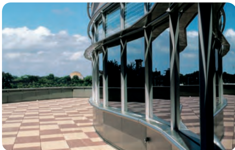
The Cleveland Clinic Taussig Cancer Center is on Cleveland Clinic’s main campus at the corner of Euclid Avenue and East 90th Street. Parking is available in the garage behind the building and in the garage on the corner of Euclid Avenue and East 93rd Street.

A geriatric oncology assessment offers you and your family reassurance and a definite plan for care. For more information or an appointment, call the Cleveland Clinic Cancer Answer Line at 866.223.8100.