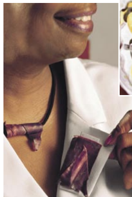
(Left) Class participants are encouraged to express their creativity through various art media.