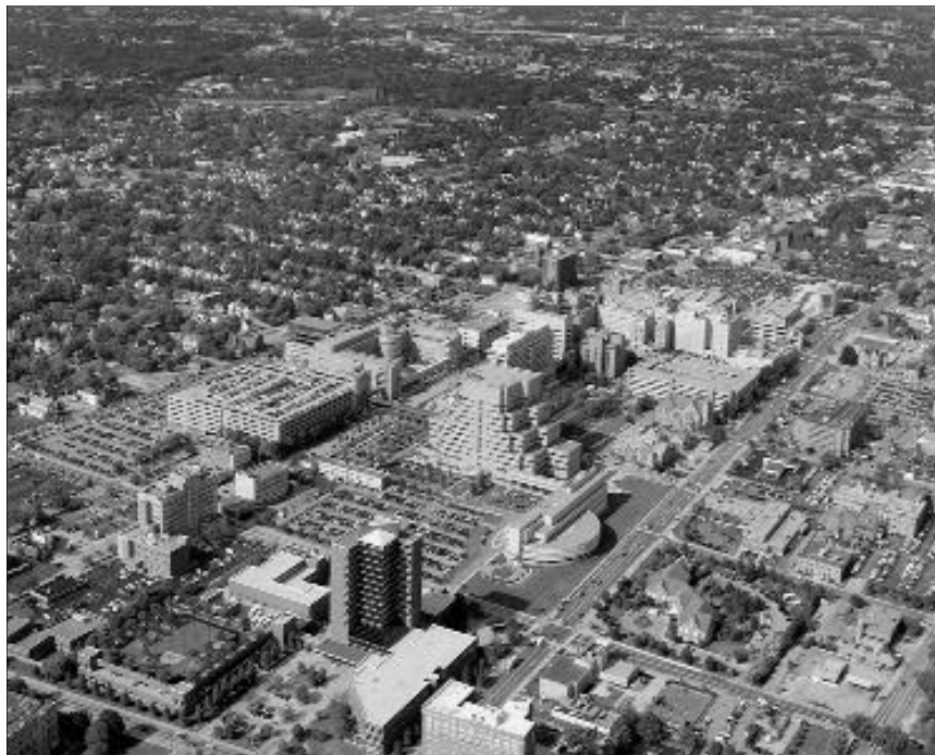
Aerial view of The Cleveland Clinic, 2003